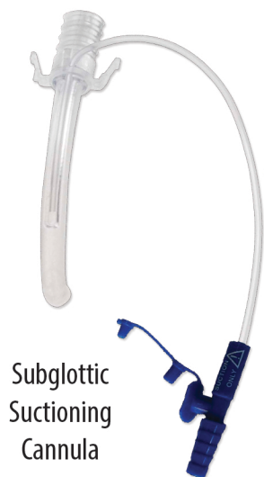
Subglottic Suctioning Cannula

Pulmodyne's Blom® Tracheostomy Tube System features a variety of unique inner cannulas which include the disposable Subglottic Suctioning Cannula, Speech Cannula for cuff-up speech, swallowing and coughing, and the Low Profile Valve (LPV™); a speaking valve for spontaneously breathing patients.