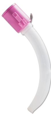
Blom® Speech Cannula