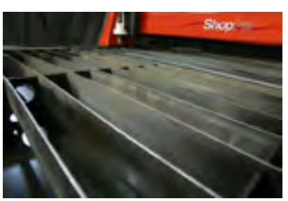
Water Table with curved slats

Koike Aronson's ShopJet is the company's newest waterjet cutting technology to meet a wide range of cutting applications, at an accessible cost. Fully manufactured in the USA by Koike, with localized service, support and parts. The ShopJet was built for proven performance and long-lasting reliability. The ShopJet makes waterjet cutting easy.