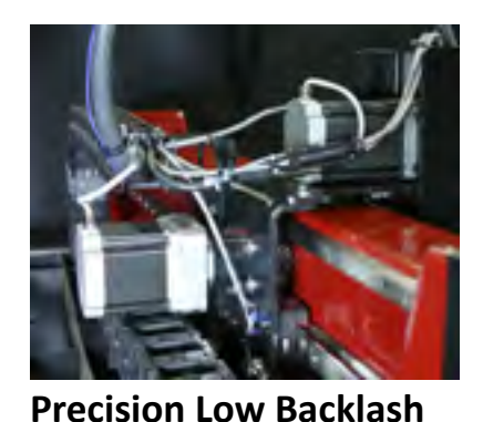
Gearboxes Large 25mm linear bearing on short axis and 30mm bearing on the cross for smooth motion