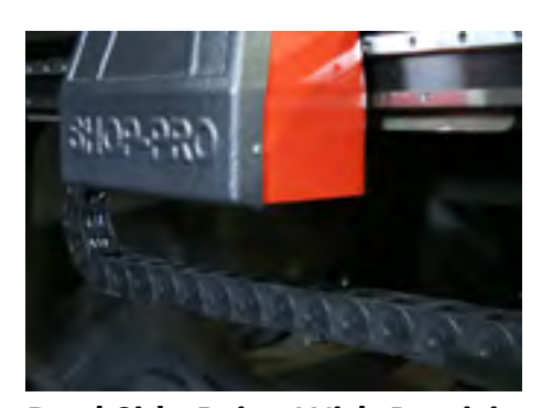
Dual Side Drive With Precision Ground Linear Bearings Provides smooth and accurate motion