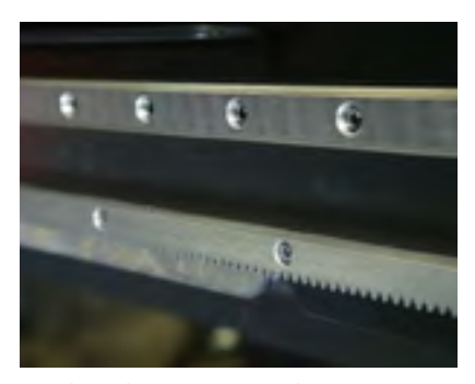
Helical Gear Rack with AGMA 12 grade ground pinions