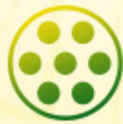
7 PIN 5A 150V