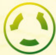
MARINCO 125/250 50A