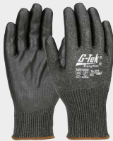
16-354 13 gauge