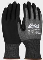
16-278 18 gauge