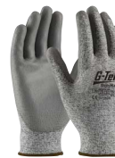
16-150 13 gauge