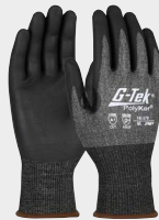
16-378 18 gauge