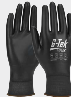
16-VRX380 18 gauge