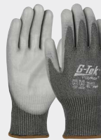
16-573 13 gauge