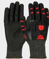
16-MP785 18 gauge