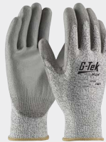
16-530 13 gauge