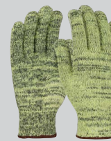
MATA502HA 7 gauge