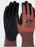
16-368 18 gauge