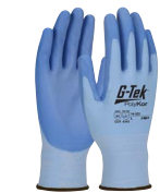
16-322 18 gauge