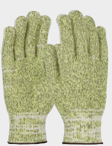
MATAKV/BKPL30 7 gauge