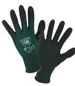
718HNFR 18 gauge