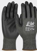
16-373 13 gauge