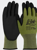
16-665 13 gauge