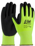
16-343LG 13 gauge