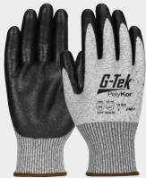
16-333 13 gauge