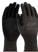
16-328 18 gauge