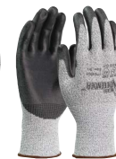
1PU4000 13 gauge