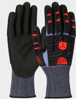
16-MP585 18 gauge