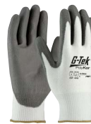
16-D622 13 gauge