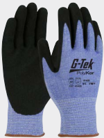
16-635 13 gauge