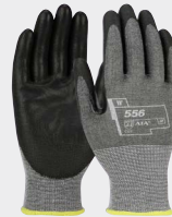
556 18 gauge