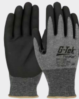
555 18 gauge