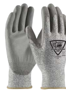
719DGU 13 gauge