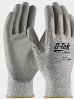
16-533 13 gauge