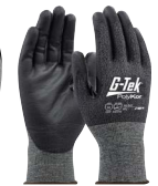
16-541 21 gauge