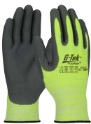
16-323 15 gauge