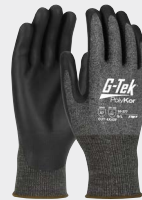
16-377 18 gauge